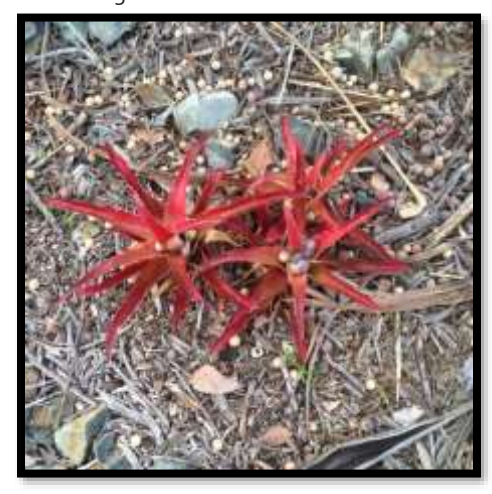
Some Hechtias along the road are beginning to get their winter color

Found composition: Ursula tuitensis and fruit from Triangle Palm