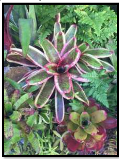
Vriesea phillipo-coburgii has great fingernails right now.

Neoregelia from Home Depot, in center of picture, showing the best colors.