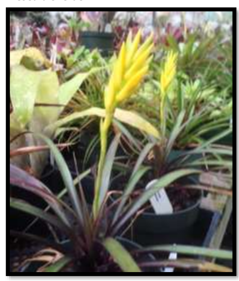
Tillandsia neglecta x stricta