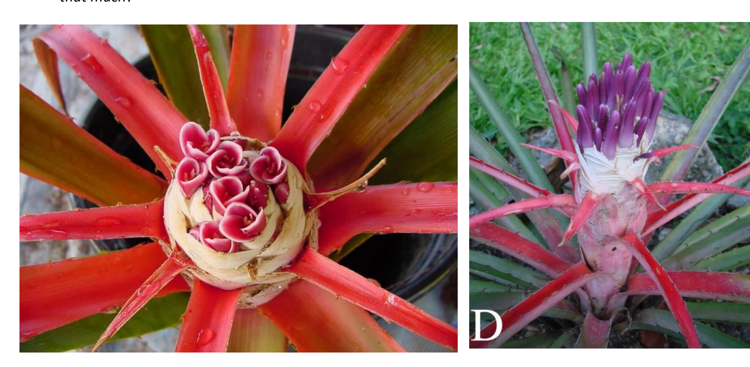
Hope these clear up any confusion you might have about Bromelias , or colors.

The same issues seem to apply regarding the following two pictures of B goyazensis . The first by an unknown photographer, the second by Monteiro. Is one mislabelled or can the flowers vary that much?