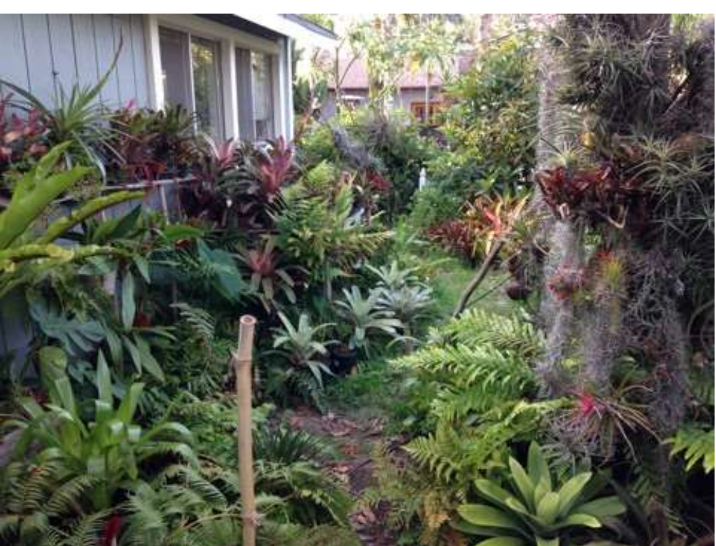
Overview of Justin's Garden.