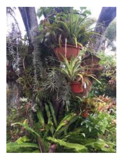
The trunk of this tree is covered in tillandsia

exceptional for their salt tolerance. He also pointed to some rare tillandsias that he has grown from seed. The collection was built up in a number of years; one could say these plants are survivors in a long term experiment.