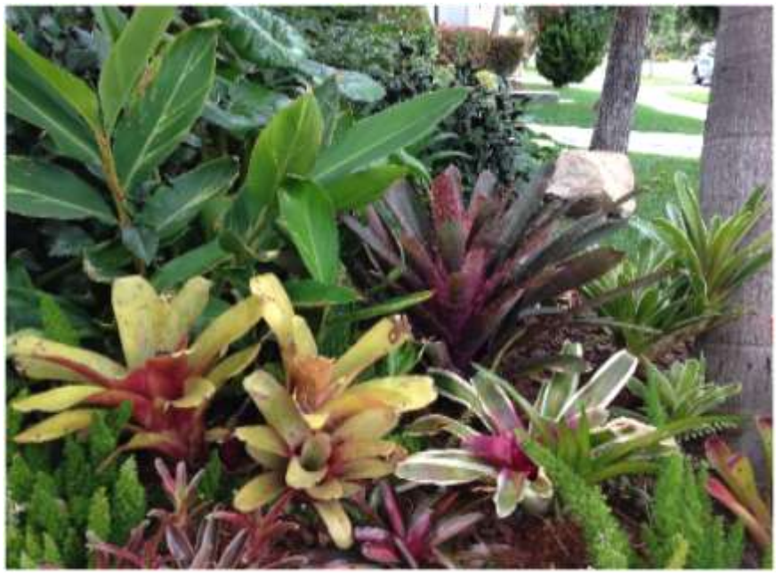
Aechmea 'rajah', vriesea hybrid, assorted Neoregelias with ginger and asparagus ferns in garden bed.

landscape use around the Southern California coast. Which other plant family combines the look of the tropics and xeriscape water needs? Yes, bromeliads might be too expensive to use outdoors, where it's survival of the fittest. Here at home. hazards include trampling by children, scorching by leaf blower, poisoning by dog urine, and mysterious critters that eat spiny plants. There are nightmare scenarios: The unlikely threat of a winter frost haunts my dreams. God forbid we have the hot dry Santa Anna winds... Plus, I find there's a lack of literature in growing