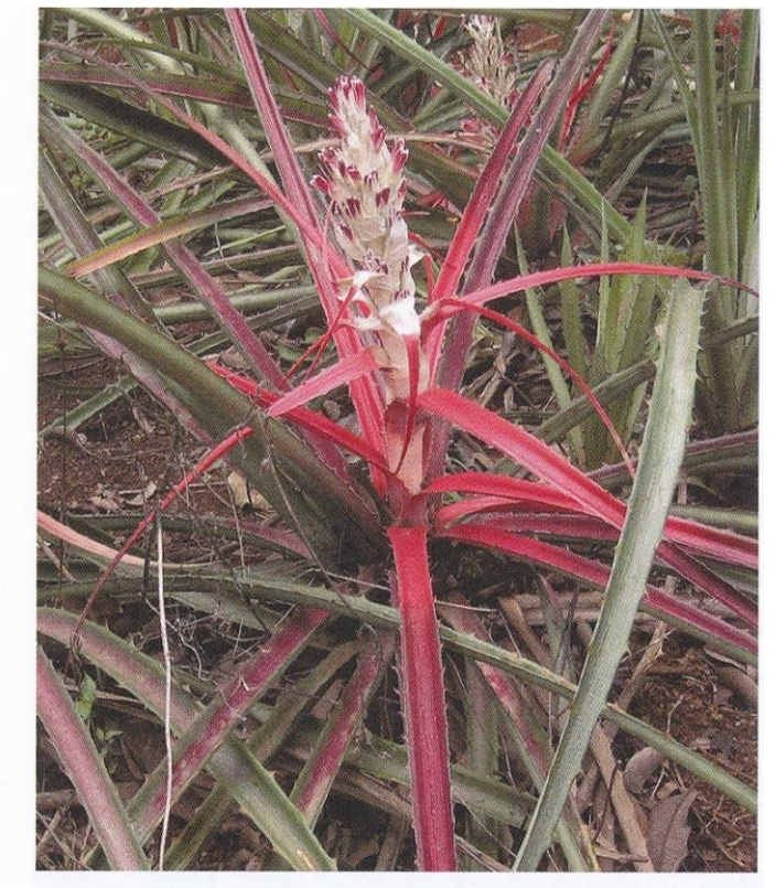
Figure 3. A flowering specimen of Bromelia tocantinense at the type locality with a dense inflorescence.

For all you who have made it to the end, I figured you deserve some modest reward, so here are some pictures of Bromelias . From the latest Bromeliad Journal here is B tocantinense . J Brom Soc 65(1) at 60, 2015.