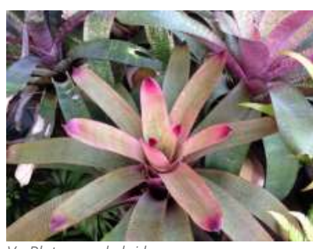
Vr. Platynema hybrid

If you don't have a shade house, knowing your garden microclimates is a fun challenge that takes some time and the ongoing seasonal shifting as shadows change. Know what plants are prone to crown rot and dump them out in the winter (heat-loving neos especially). If your garden is crowded like mine, don't neglect the importance of cutting and pulling all dead foliage (airflow