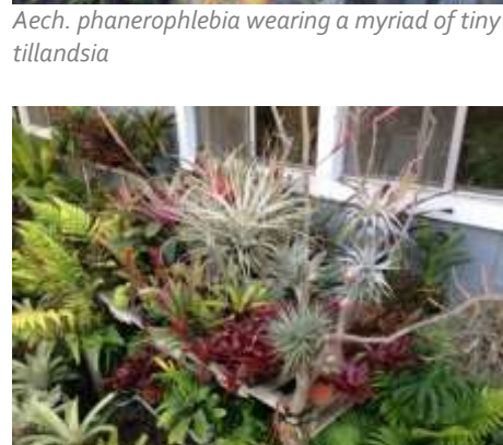
Tree display with assorted tillandsia and Neo. fireball

Vriesea platynema hybrids are beautiful. Neo. carcharodon and Aech. chantinii are too, but neither like it below 45. Salt tolerant and