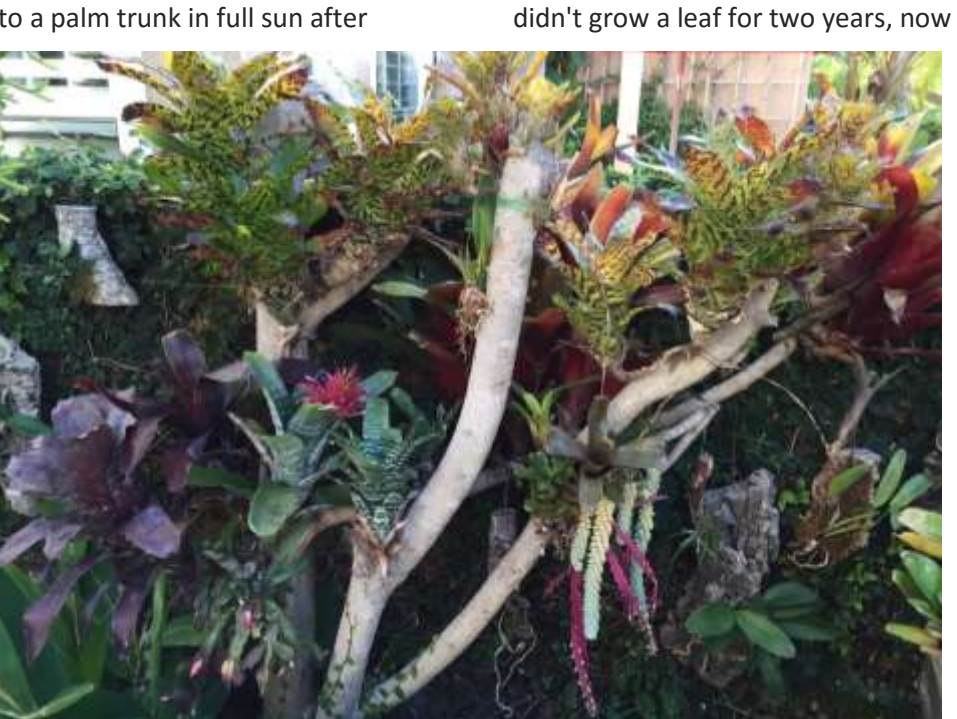
It's amazing how much you can pack into a 6-foot epiphyte tree. From top: A. correia-araujoi, Billbergia 'brimstone', small neos, A. fasciata purple and regular, A. chantinii, orchids, epiphytic cactuses, donkey tail. these guys in their natural range.

Patience is key. Sometimes a good plant only comes in the second or third generation. There were several occasions when I bought a pup only to see it develop into something that wasn't as pretty as the pictures of the plant in the internet. The plants we buy from professional growers are usually rushed into maturity with a lot of fertilizer. Dark green floppy leaves are common. Well, sometimes it takes more than a generation for a plant to adapt to your garden conditions and thrive. I have a clump of Hohenbergia castellanosii that didn't grow a leaf for two years, now