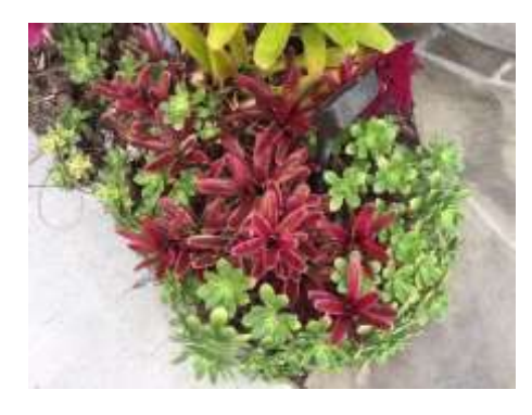
Color contrast: Neo donger with succulents

Finally, I would like to share with you my favorite bromeliads for landscape growing. In my experience, these need less water than succulents: